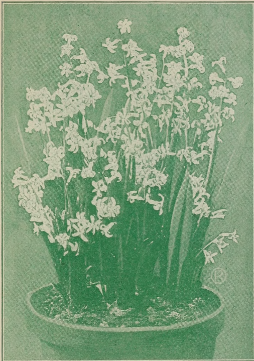
A Pot of Roman Hyacinths.

Choice bulbs, each, 6c; doz., 50c; 100, $3.75